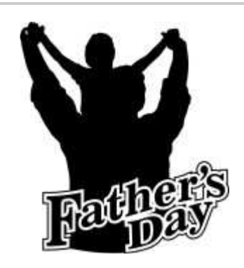
Proverbs 23:24 The father of a righteous man has great joy; he who has a wise son delights in him.